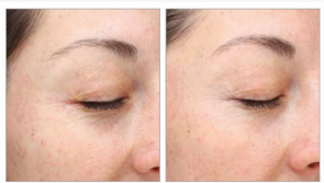
1 month post 1 treatment