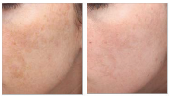
1 month post 1 treatment